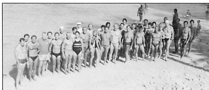
Fifty-eight swimmers competed in the OCC Invitational Swim this year.