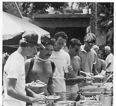
After-race brunch was popular with swimmers.