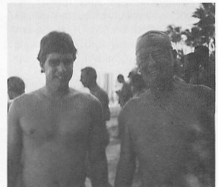
Top Left: Swimmers take to the water at the start of the 4th annual Open-Ocean Swim between Outrigger and Waikiki Swim Club.