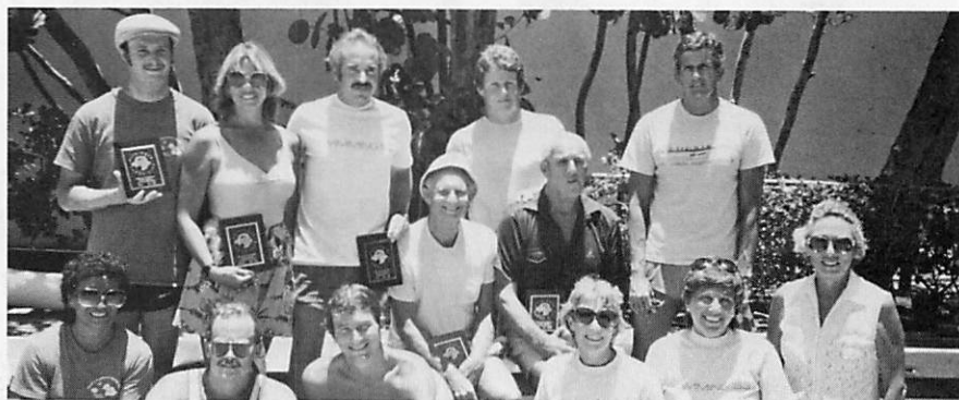
1st place finishers.