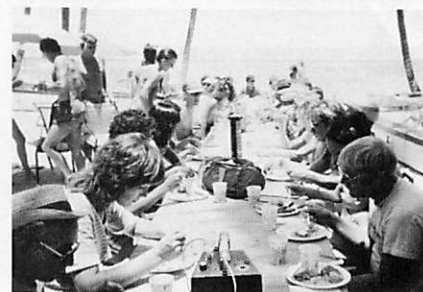
Breakfast culminated the morning swim.