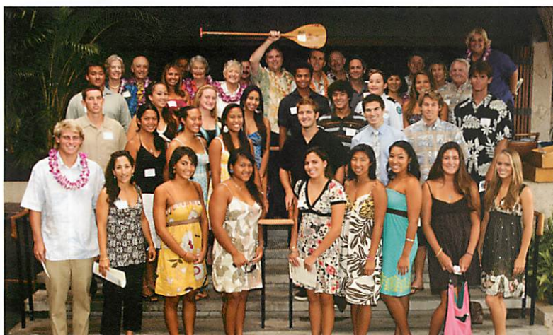
ABOVE: Grantees, Scholarship winners, ODKF Board members and Gold Medalists enjoy a photo op.