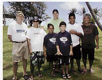
Boys & Girls club photos by Monte Costa