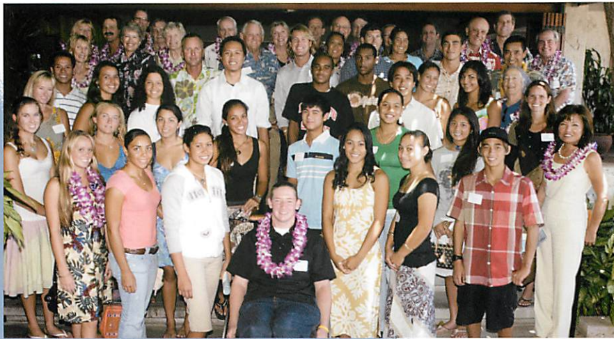
Scholarship winners and grantees with ODKF Board Members and Gold Medalist Donors without whom there would be no awards.