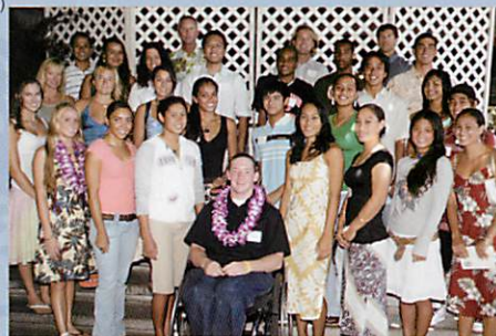
2006 Scholarship and Athletic Grant Awardees

US Swimming Nat'l & Jr. Championships (California) Surf Meets (Honolulu & Kauai) Jr. World Kayaking Tour (Italy, Germany, Georgia) Paddleboard competitions (Fiji & Australia) Irvine Summer Waterpolo Program (California) Onipa'a Volleyball Club (Oahu) Onipaa Volleyball Club (Oahu) 2006 USA Swimming Sprint Championships 2006 Zone Select, UT & Speedo Championship USA Volleyball Jr. Olympics (Georgia) Okinawa Freedive Invitational (Japan)