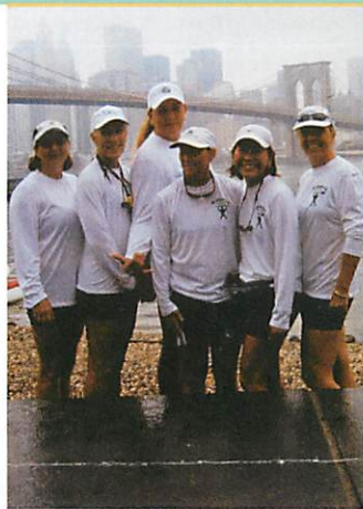
First time grantee, Wa'akapaemua Canoe Club from Molokai placed 1st in the Senior Masters and 3rd overall in the New York City Liberty Challenge Outrigger Canoe race.

I'm always searching for the right message to tell people why ODKF deserves support and the impact of their generosity. Instead of me carrying on, I wanted to