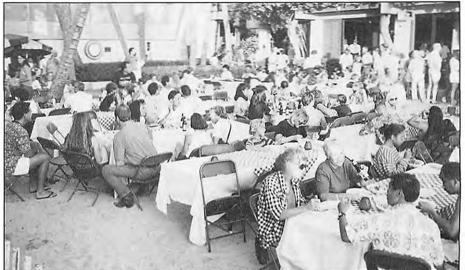
Hundreds of members gathered at the Club for the Steak Fry.