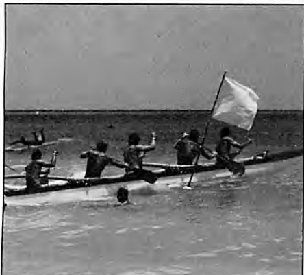
Senior Men turn on the flag on way to winning their race.