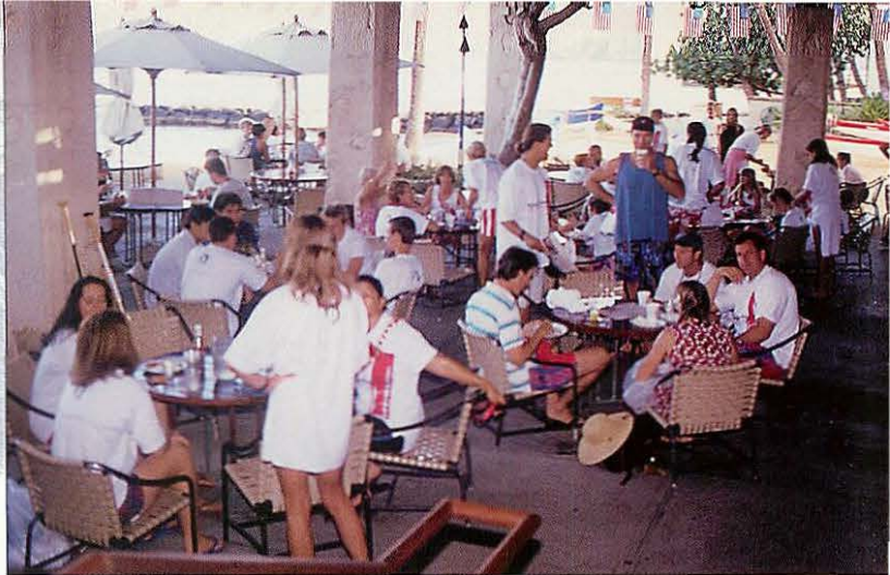
Paddlers start the day with an early morning breakfast

persons under the age of 21 are discouraged from entering the Club after 8 p.m. Club membership cards for identification and verification of age will be required.