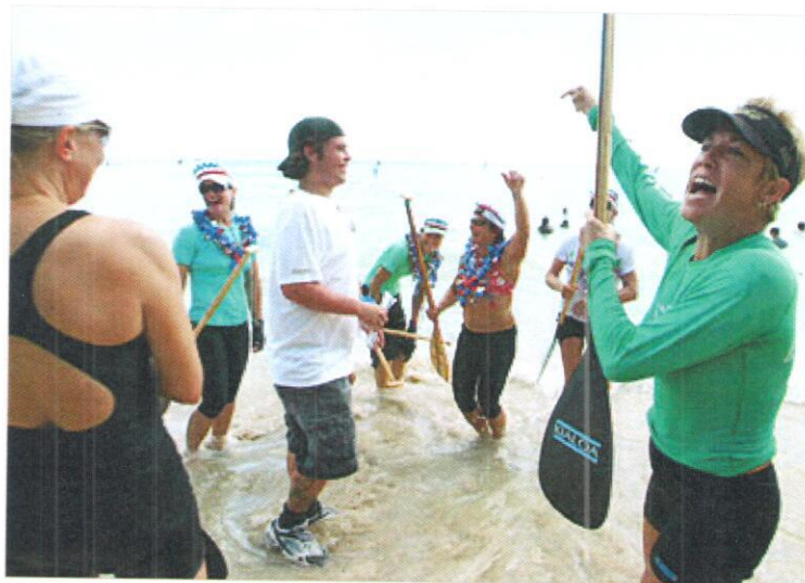
Members of Lanikai Canoe Club's women 40 crew celebrated yesterday's win at the Walter J. Macfarlane Regatta.