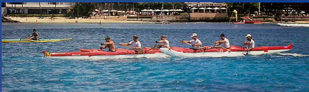
Outrigger moved to a five-boat lead by the time the crew passed a large cheering crowd at the Club enroute to the finish line. They paddled in the fiberglass canoe, Mamala.

When the leaders converged off of the Diamond Head Lookout, there was a six second separation between first place Outrigger and Lanikai with New Zealand close behind. Matching Lanikai change for change and scratching for every