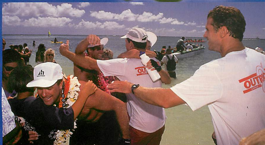
Crew members congratulate each other after reaching the beach.