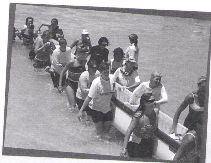
The girls carried the canoe up onto the sand.