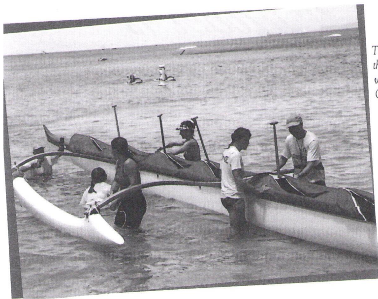
The women unrigged their canoes in the water after the Dad Center race.

Outrigger's three women's crews posted good finishes in the Dad Center Long Distance Canoe Race on August 27 from Kailua to the OCC Beach. Hui Nalu won the annual OCC-sponsored event in 3:10:50, but Outrigger's crews finished fourth, 13th and 16th.