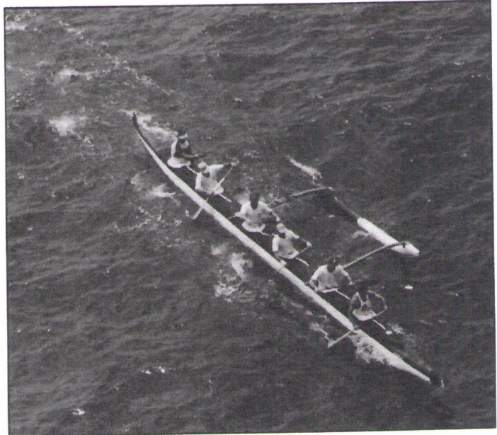
The OCC masters won their Kona race.