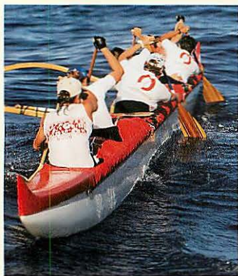
Outrigger III women paddled hard in the Na Wahine O Ke Kai.