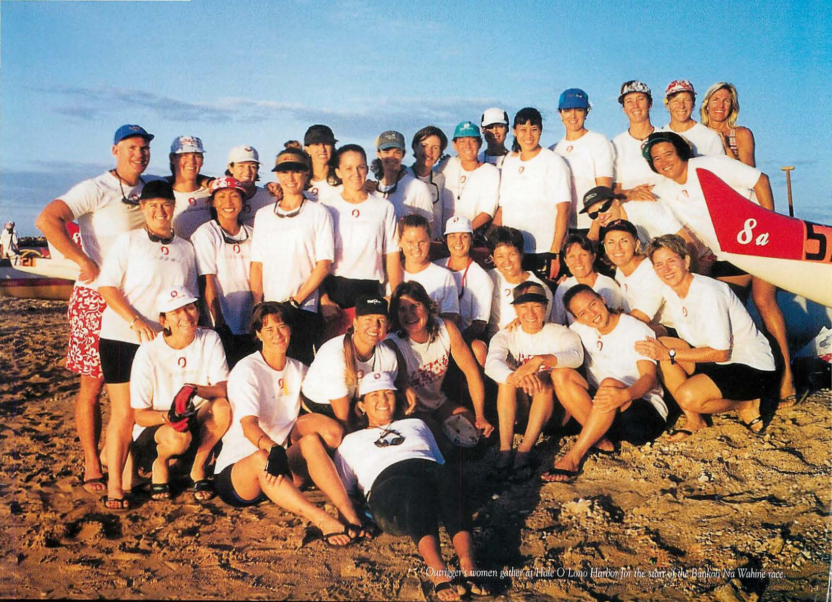
Outrigger's women gather at Hale O Lono Harbor for the start of the Bankoh Na Wahine race.