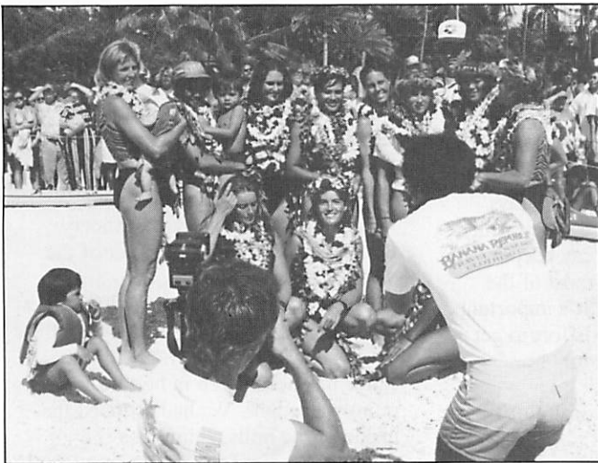
After bowing to the Aloha Week Court, Outrigger's winning crew lined up to be photographed by the news media.