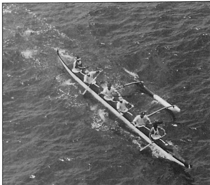
The OCC masters won their Kona race.