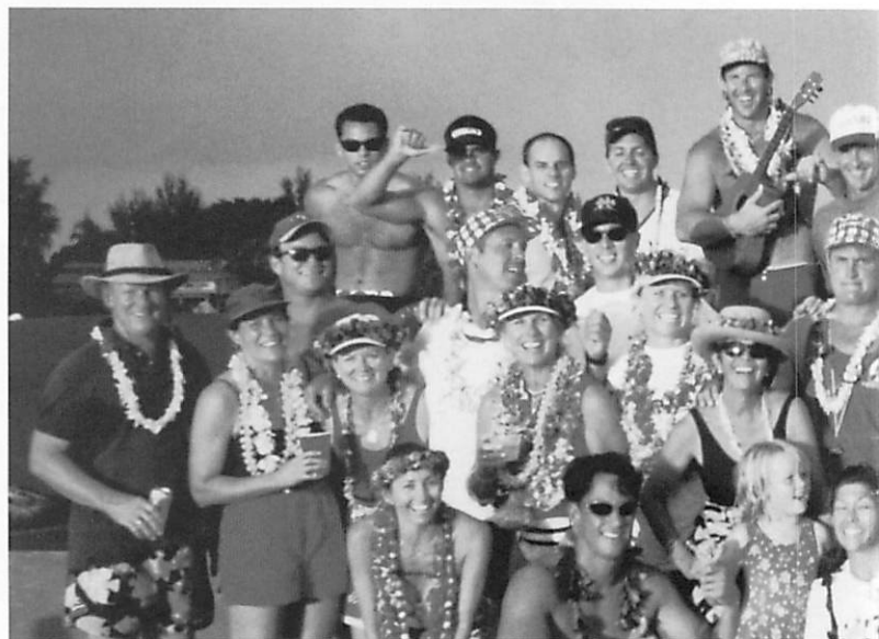
Paddlers gather with trophy after winning State Championship.