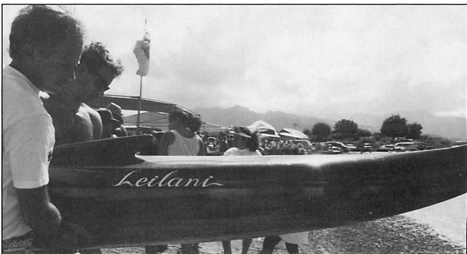
The renovated Leilani is placed in the water for the first race of 1990.