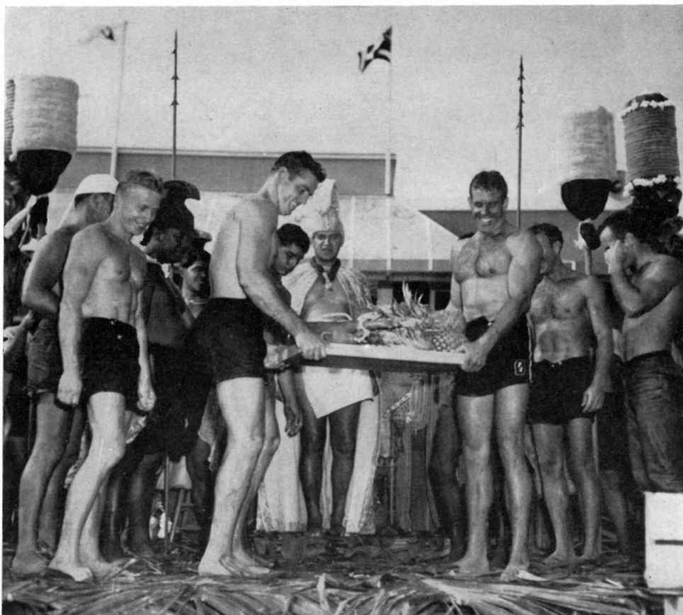
SENIOR SIX ACTUALLY BRING HOME BACON ON KAM DAY - 1950