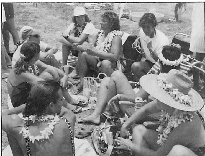
Sharing 'after the race' stories were the novice women.