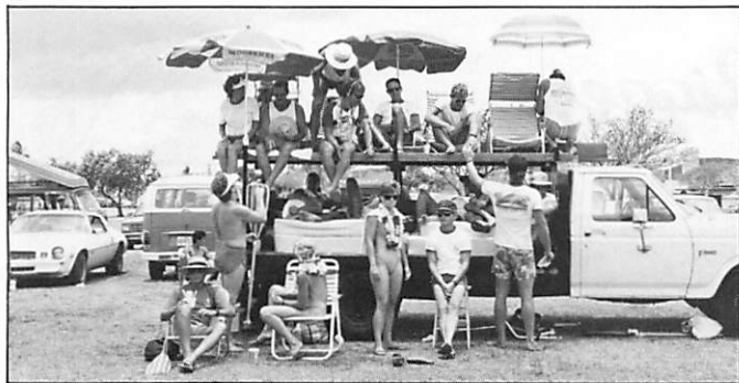
Outrigger paddlers and fans had a great vantage point as they watched the Club win the Oahu championship for the second year in a row.