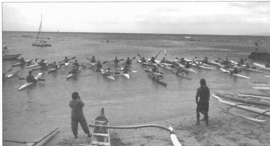
Forty-two Surfski's wait for the start of their division in Winter Tri-Ocean Race.