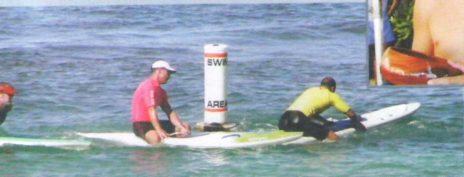
Paddleboarders turn on the buoy for second circuit.