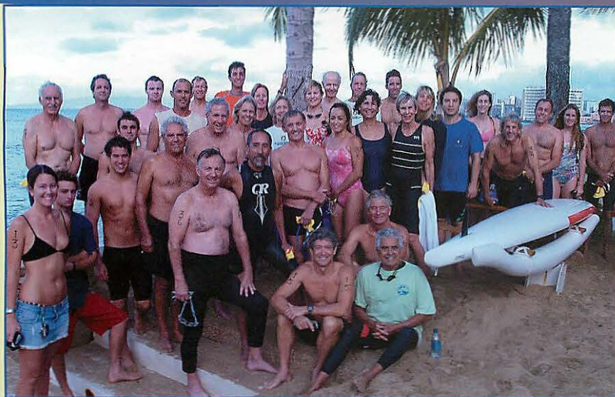
Thirty-six members entered the Castle Swim.