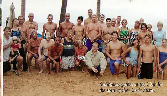
Swimmers gather at the Club for the start of the Castle Swim.