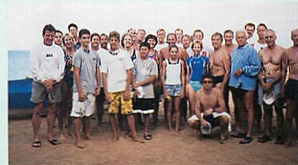
Swimmers gather at the start of the Castle Swim.