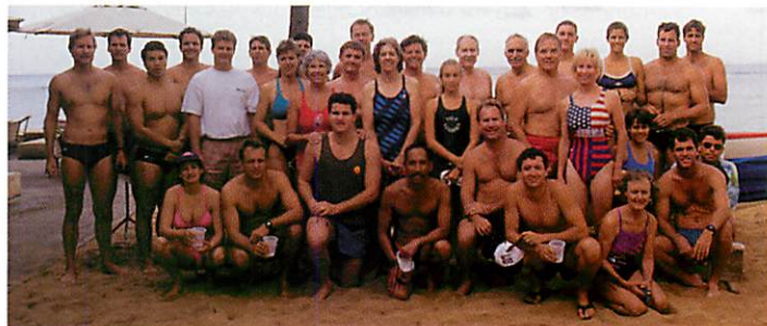
Castle Swimmers gathered on the beach at the Club prior to the race.

In the spring of next year, the Swimming and Running committees plans to host an Outrigger Canoe Club Biathlon. It will be a 5K run around Kapiolani Park followed by a 1K swim in front of the Club. Stay tuned and start getting in shape! ☺