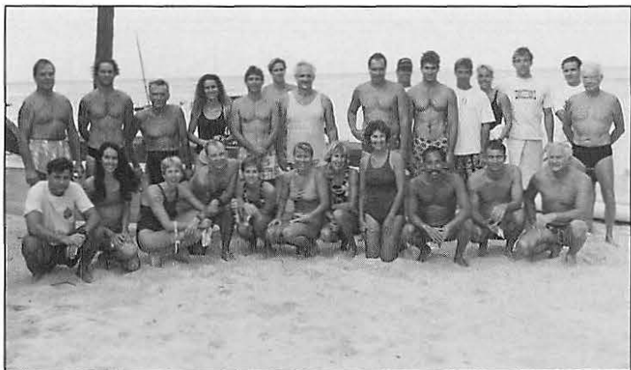
Swimmers line up on the beach before the Castle Swim.