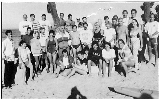
Swimmers gathered on the beach at the start of the swim.