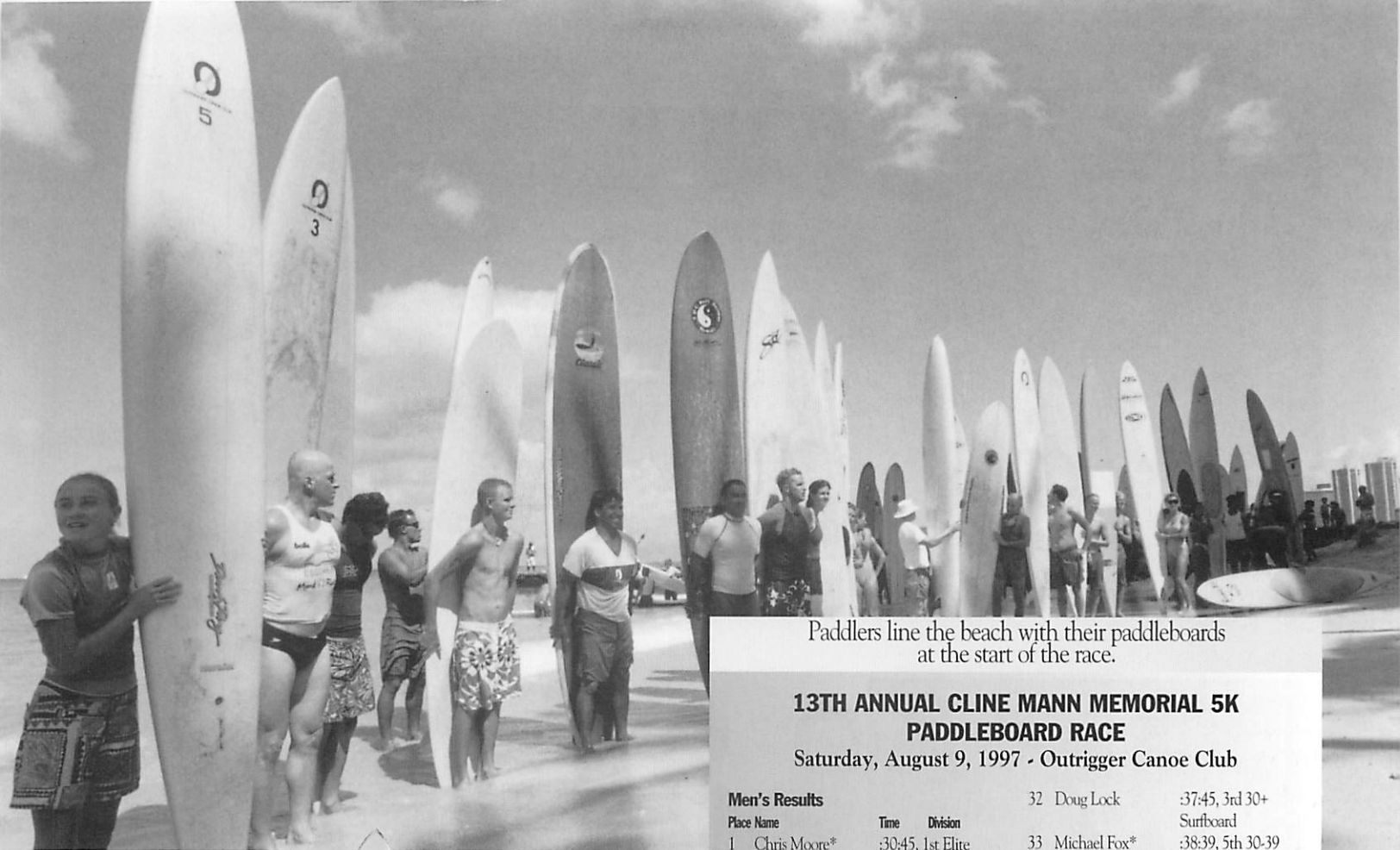
Paddlers line the beach with their paddleboards at the start of the race.