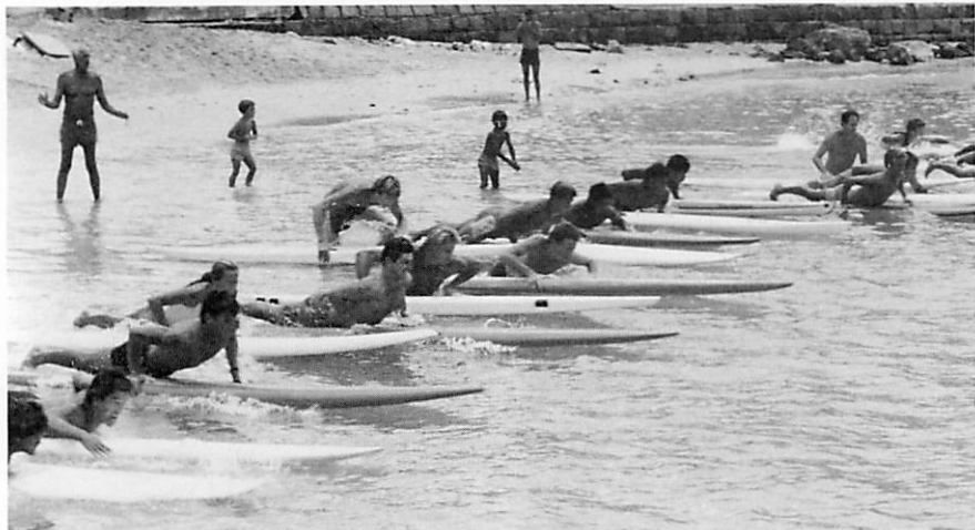
Start of Paddleboard Race, Saturday June 16.