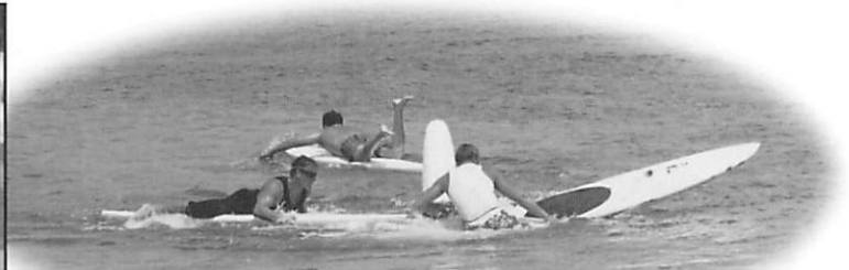
It was a close race as the top three finishers round the buoy on the first lap of race.