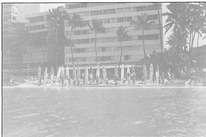
Paddleboards line the beach before the race.