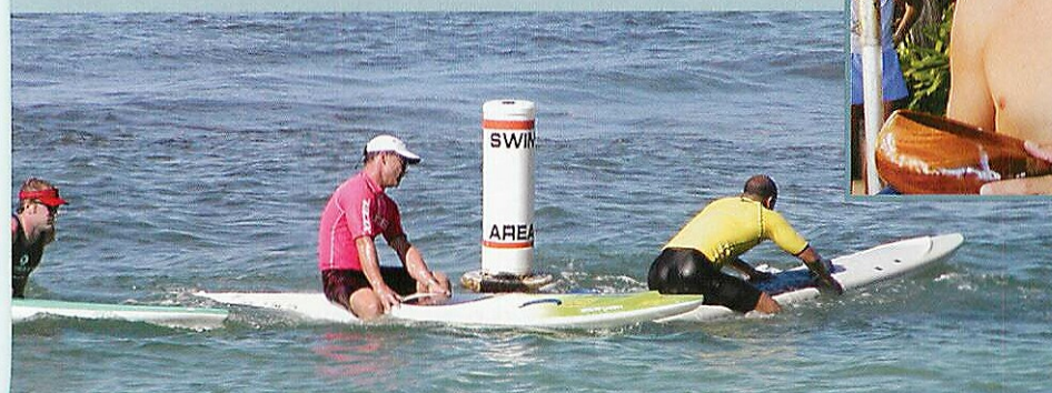
Paddleboarders turn on the buoy for second circuit.