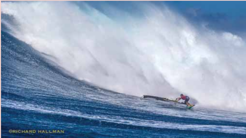
Kai Lenny windsurfing.