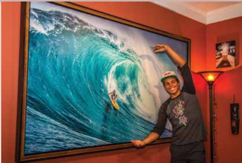
Kai Lenny stands in front of a photo of him surfing.