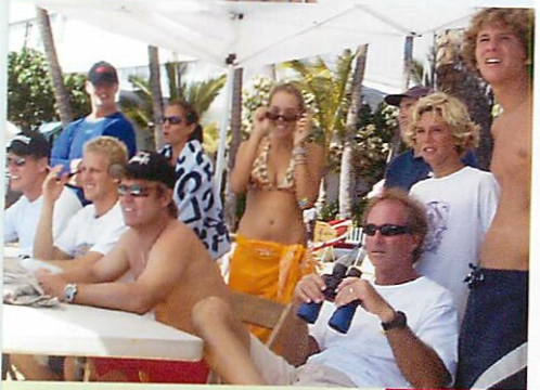
Judges and spectators watch the action.