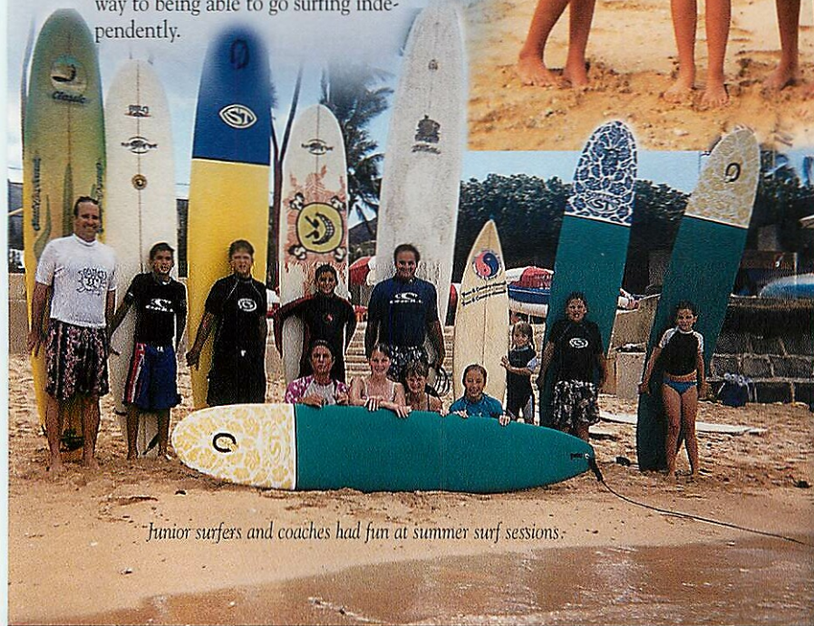
Junior surfers and coaches had fun at summer surf sessions.