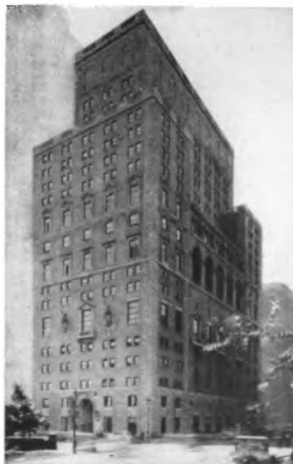
CITY CLUB HOUSE NYAC

In addition, there are three private dining rooms on the 12th floor, the Colonial, the Green and the Manhattan