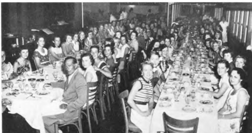
On Monday, June 18, the O.C.C. entertained the visiting young ladies from 14 mainland universities at a dinner party. They are visiting Hawaii and taking a six week summer course at the University of Hawaii. Other parties are being planned for them.