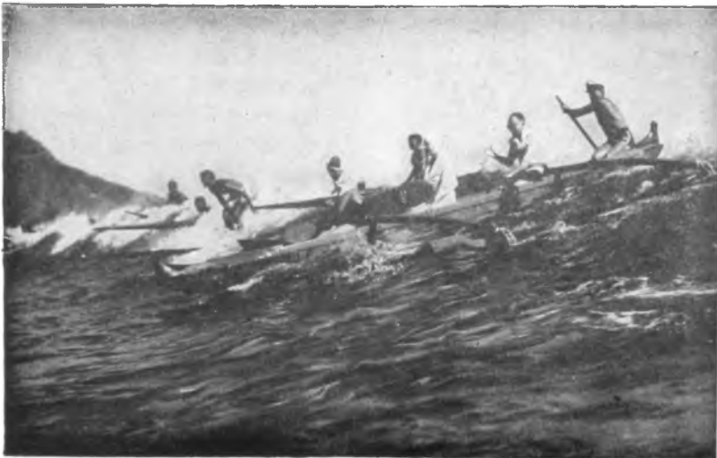
Eleven Expert Men On Hand To Serve You