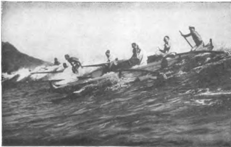
Eleven Expert Men On Hand To Serve You