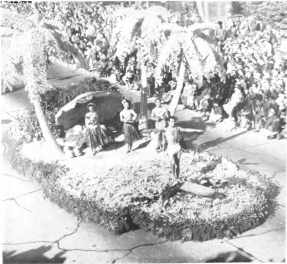
HAWAII'S FLOAT "HAWAIIAN HOLIDAY" won first prize at Tournament of Roses Parade, January 1st, 1951. This lovely float was made up of 167,000 orchids and other flowers, flown from Hawaii. It looks like a bit of Waikiki.