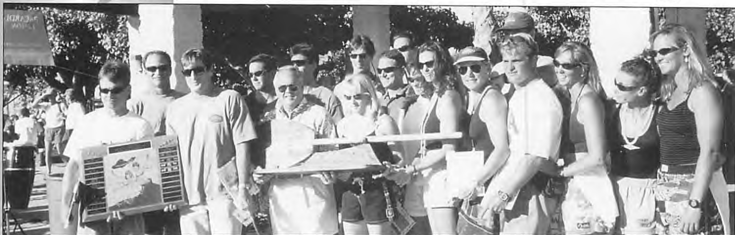
OCC Paddlers with their trophies at the finish line.