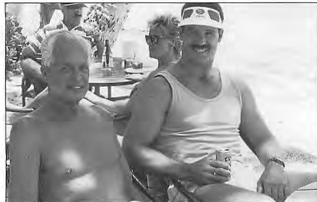
Cline presents Cline Mann 5K Paddleboard Trophy at first race.