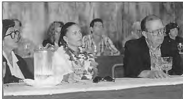
Board members listen to committee reports.