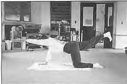
Super Person Pose