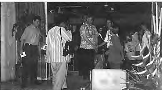
The President shakes hands as he leaves the Club.