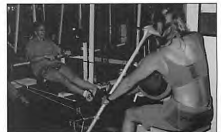
Paddlers try new rowing ergometer.

As with all Fitness Center equipment, the fitness trainer will be happy to show you how to use these great new fitness tools. ☺