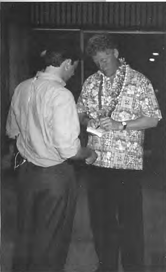
The President signs an autograph.

The President drank Corona beer while working the crowd and visiting with his entourage.