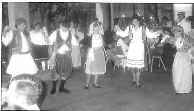
Greek dancers perform.