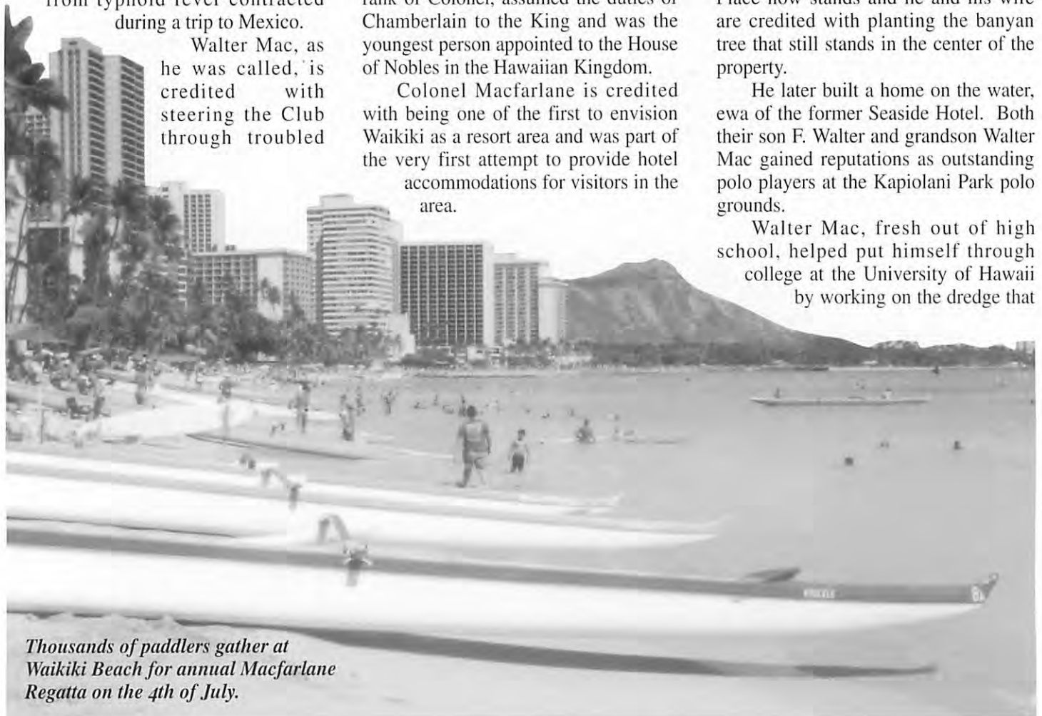
Thousands of paddlers gather at Waikiki Beach for annual Macfarlane Regatta on the 4th of July.