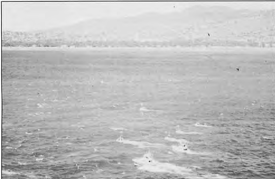
Helicopter photo by Irwin Malzman