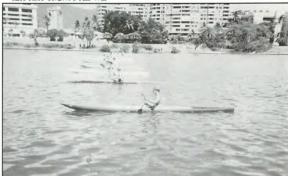
Kayakers line up at start of Steinlager race.