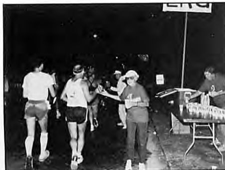
Working at the Club's Marathon Aid Station is lots of fun.

Young and old, we need your help! Bring your friends and have some fun.