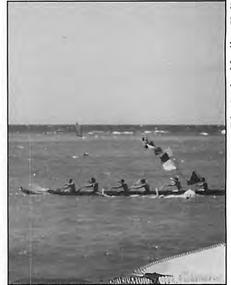
The Sophomore Men had a decisive victory.