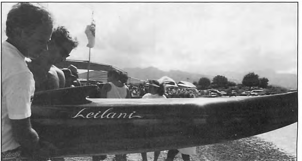
The renovated Leilani is placed in the water for the first race of 1990.