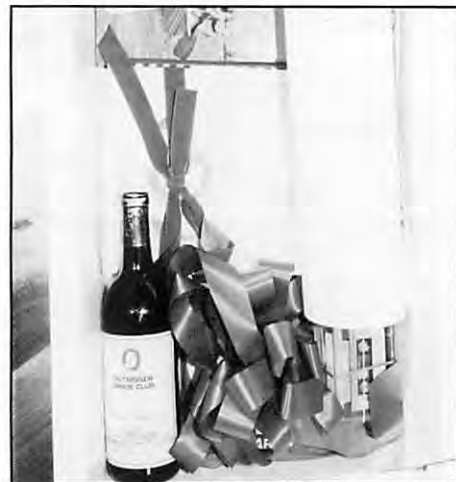
The Time Capsule contains memories of the Club's first 25 years of Diamond Head.

The Time Capsule is scheduled to be opened on Club Day in the year 2014 when the Club celebrates its 50th Anniversary at Diamond Head.