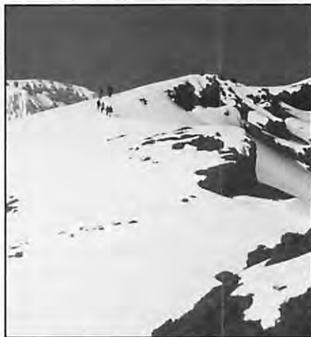
Snow marks the trail from Stella Point to Uhuru Peak.

Mount Kenya, with a summit at 17,058-feet serves as our acclimatizing hike, followed by a wonderful five-day visit to the spectacular Amboseli game preserve. Lions, elephants, cape buffalos, rhinos are but a few of the animals that live there protected from poachers,